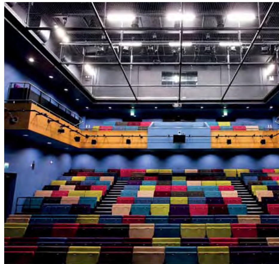
Inside the Lincoln Performing Arts Centre, Brayford Pool campus. 21

The space boasts a 446-seat theatre, three large studio spaces for performance and rehearsal, backstage facilities and workshops. The Centre regularly holds high-profile live performances, including a broad variety of plays, comedies and musical concerts. Past performances have included the National English Contemporary Ballet, Nicola Benedetti, Chris Addison, We're going on a Bear Hunt , The Caretaker , BBC Radio 4's Just a Minute and Ian McMillan. Each performance is open to all students and the wider community to attend, firmly positioning LPAC as one of the city's top arts centres.