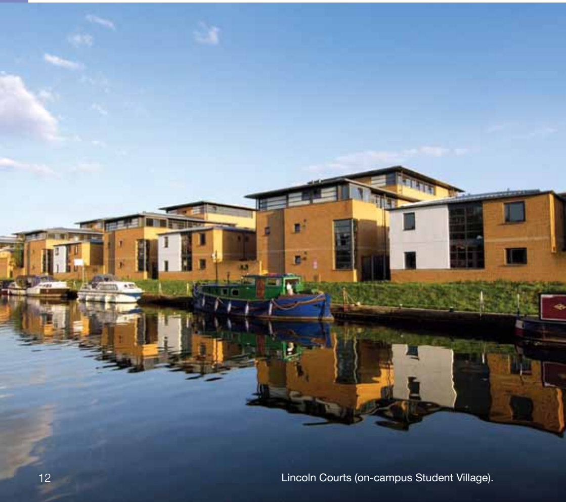
Lincoln Courts (on-campus Student Village).