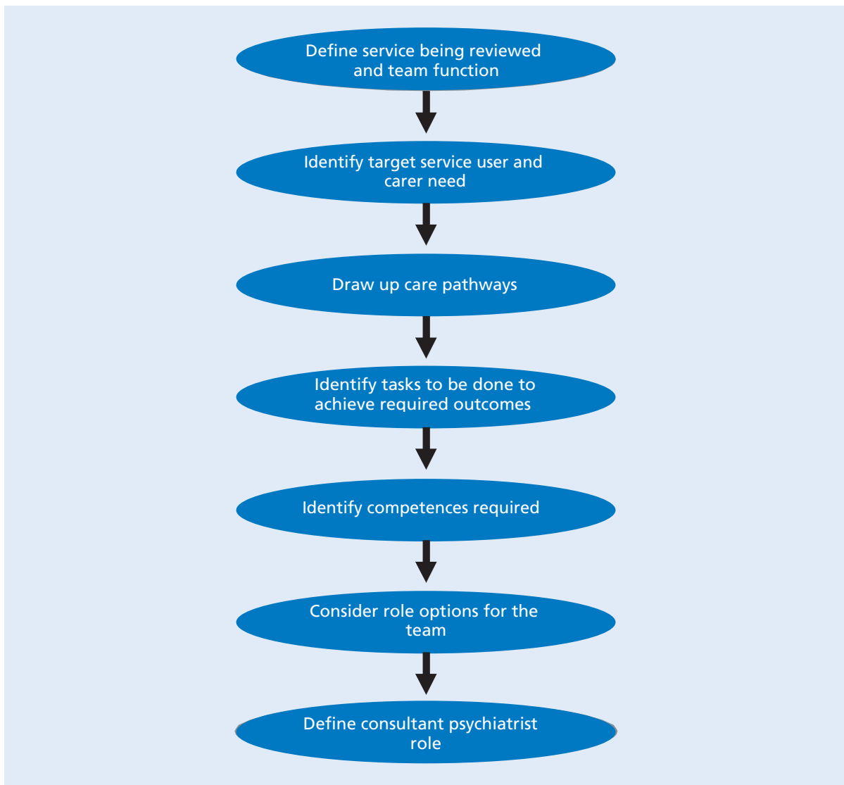
Figure 1 Analysing service demand and the consultant role